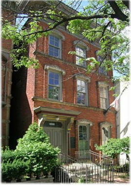
The Beaubien House