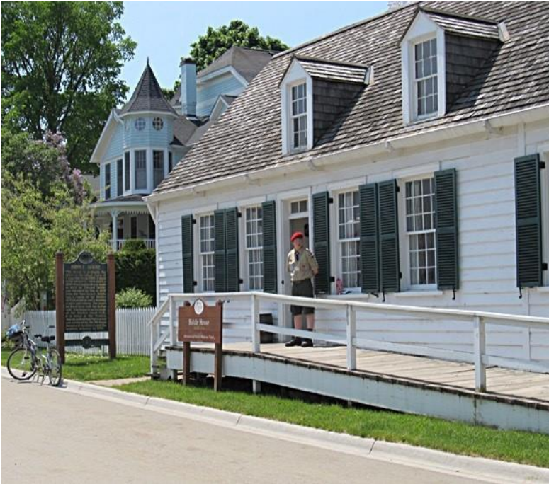
The Biddle House - Mackinac Island